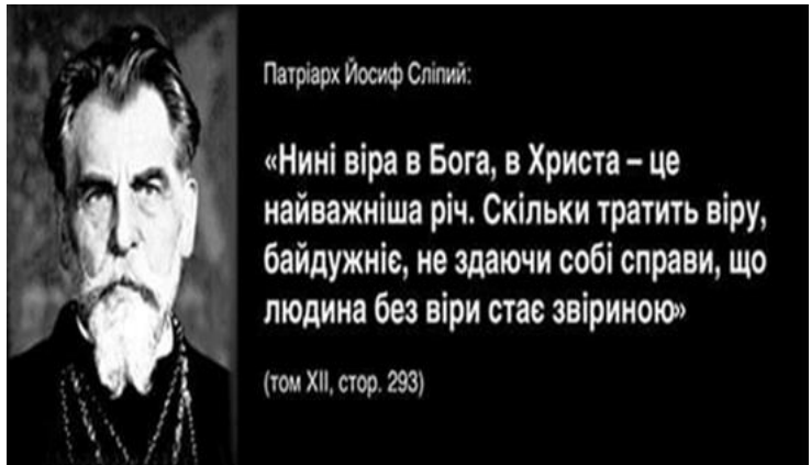
Патріарх Йосиф Сліпий:

«Нині віра в Бога, в Христа – це найважливіша річ. Скільки тратить віру, байдужніє, не здаючи собі справи, що людина без віри стає звіриною»