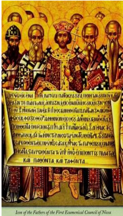
Icon of the Fathers of the First Ecumenical Council of Nicea

Parish web-site: http://kelowna.nweparchy.ca/