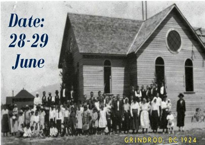
GRINDROD, BC 1924