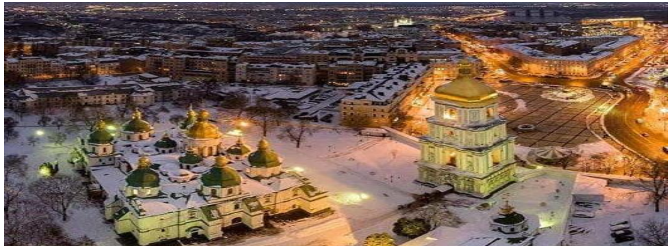
Saint Sophia Cathedral (built by Prince Jaroslav the Wise in 1037 A.D.) Kyiv, UKRAINE