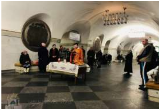
PHOTO: Priests descend into bomb shelters: Divine Liturgy in the Kyiv underground at metro station/subway station

that part of their lives that was lost that day as well. info@rachelsvineyardkelowna.com www.rachelsvineyardkelowna.com f Rachel's Vineyard Kelowna: 250-762-2273