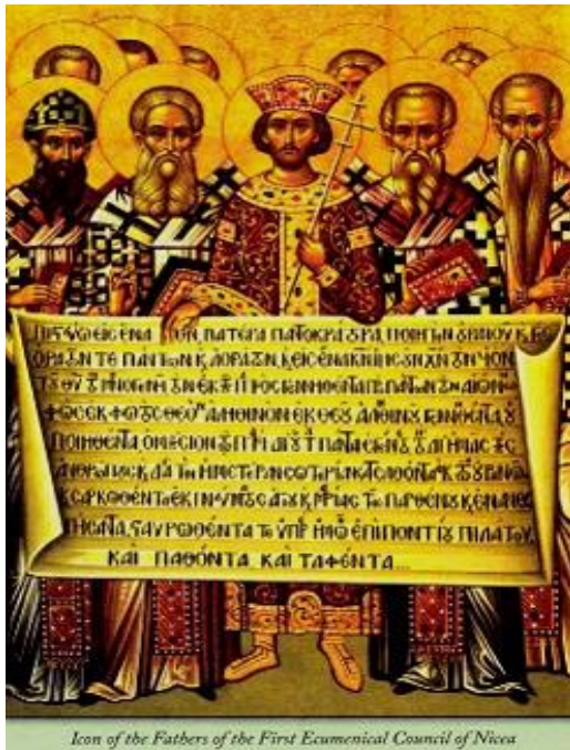
Icon of the Fathers of the First Ecumenical Council of Nicea