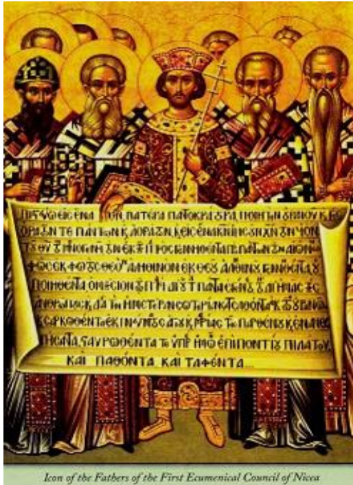
Icon of the Fathers of the First Ecumenical Council of Nicea