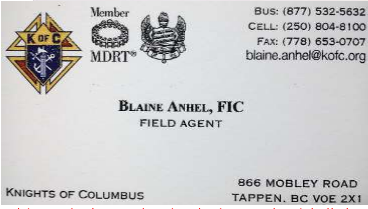
If you wish your business to be advertised at our church bulletin, please, let us know by contacting the parish office.