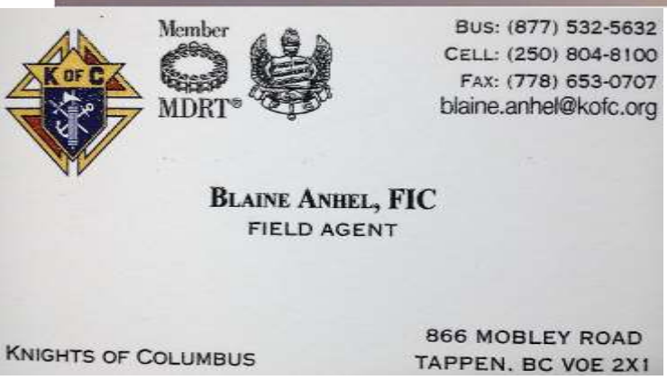
If you wish your business to be advertised at our church bulletin, please, let us know by contacting the parish office.