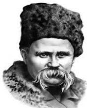
Тарас Шевченко (1814—1861)

Taras Shevchenko – a special celebration to honour our great Ukrainian poet, Taras Shevchenko will take place today, Sunday, March 19 th after the Div. Lit. at 9:00 a.m.